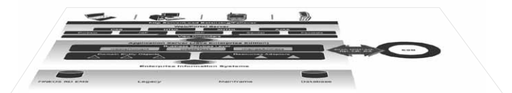
FINEOS Technical Architecture